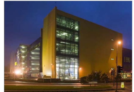
IKEA mega-store, UK (Stubbs Rich)