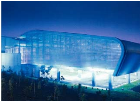
ASB 'C Drive' Building, Auckland (Jasmax)