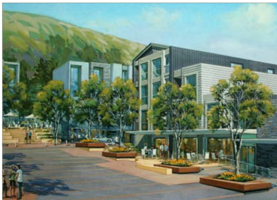
Kingston West (Quadrant Hotel), Queenstown (Clark Brown Architects)