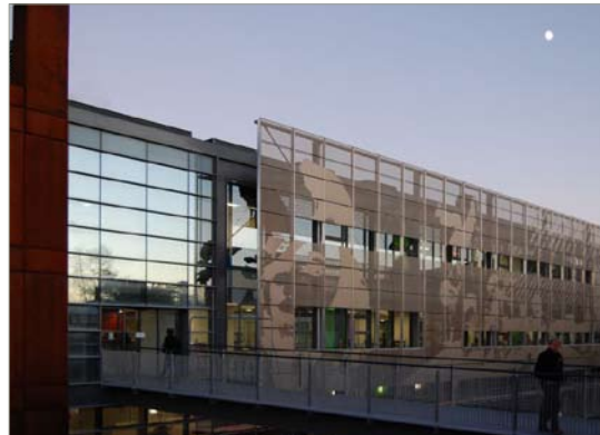
Hereford Learning Village, UK (Stubbs Rich)