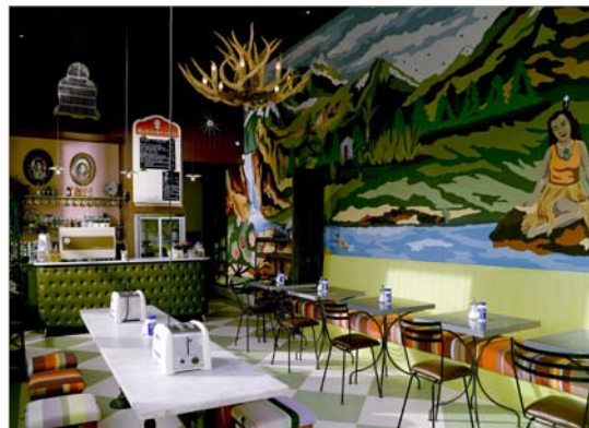
Queenies Cafe, Auckland (Clark Brown Architects)